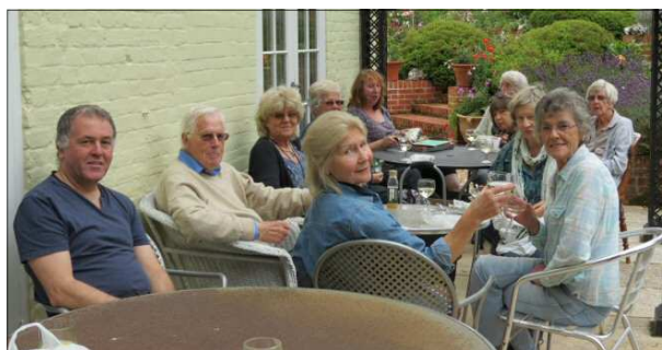
Lunch on the terrace at The Old Rectory

Our visit to The Old Rectory at Swarraton was made extra special by the welcome of the owners who had laid on coffee on arrival and even served wine at lunchtime. The views and the garden were gorgeous and the alpacas were friendly too!