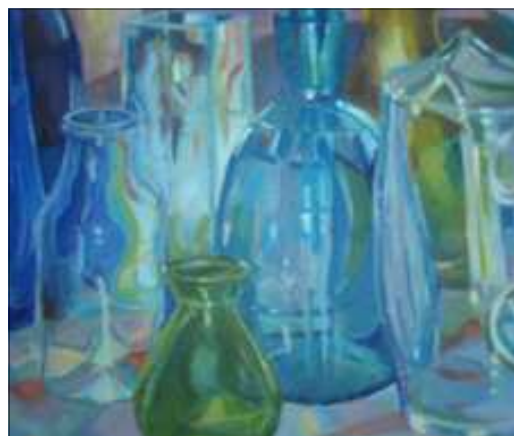
Bottlescape by Jacky Snowdon