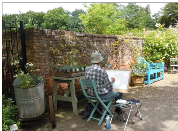
A spot in the shade at West Green House

The visit to West Green House at Hartley Wintney was a scorcher. Staff were busy getting ready for the start of their Opera Season and the orchestra could be heard rehearsing for their next performance.