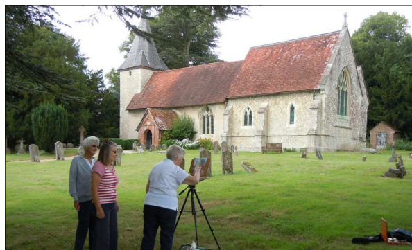
Painting in the Churchyard at Upper Farringdon.

Upper Farringdon is the perfect picture-box village and there were plenty of subjects to choose from. We were hosted by Gillian MacCallum who opened her garden for picnic lunches and which itself was a great spot for painting, taking in the delights of the cottage garden.