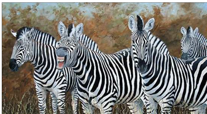
The Joker by Jonathan Newey

Painting days will include the historic and peaceful Hospital of St Cross and Down House garden in Itchen Abbas, complete with its potager, hot and rope gardens, vineyard and woodland.