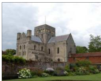
Hospital of St Cross