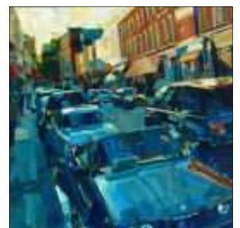
Side Street Sunset

Learn more about Hashim at www.hashimakib.com and visit Gareth Watling at www.gwbirdpaintings.co.uk to see more of his delicate bird portraits.