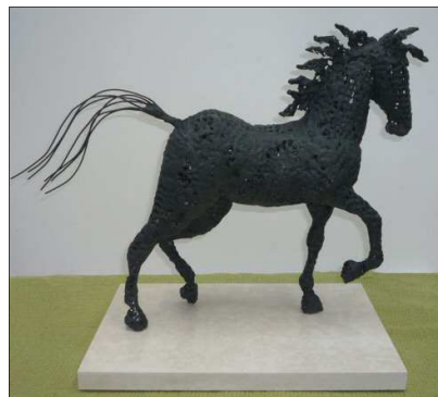
Horse in wire mesh and chemical metal, by Jen Boardman.

A group of 30 sculptors of all levels of experience, members work in a wide variety of ways using