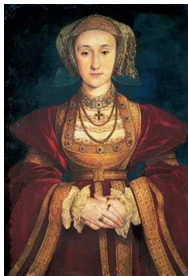
Anne of Cleves by Hans Holbein the Younger