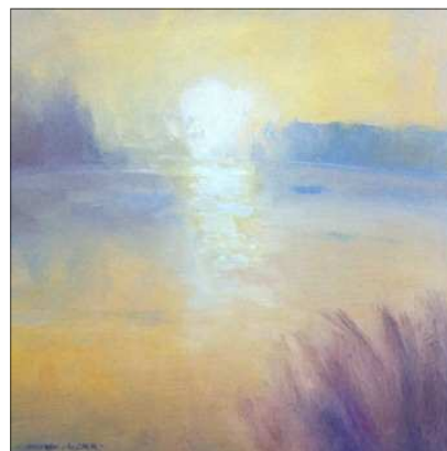
Sun on Wide River