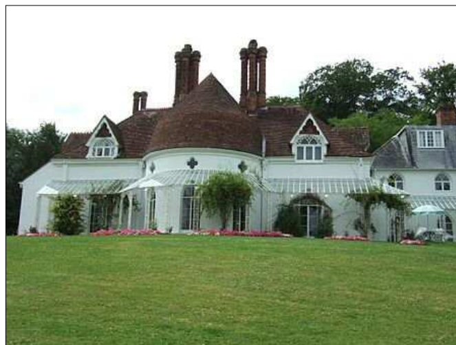
Houghton Lodge on the Test

Another popular venue will be St Cross Hospital, founded in the 12thC. Back by popular demand, it is a wonderful place to spend the day. Also arranged are visits to the Longwood estate where we can promise you lots of animals, old buildings and architectural features and Cheriton Cottage (not a cottage!). This house enjoys the River Itchen running through and there should be horses to be painted.