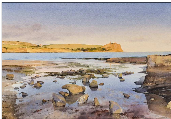
Kimmeridge in watercolour by Oliver Pyle.

"The British landscape is unique," says Oliver "there is so much diversity that can be found on such a relatively small island. I understand the frustrations that the British weather confers but as an artist it creates endless opportunities."