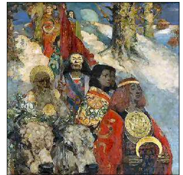
The Druids Bringing in the Mistletoe by George Henry and Edward Atkinson Hornel